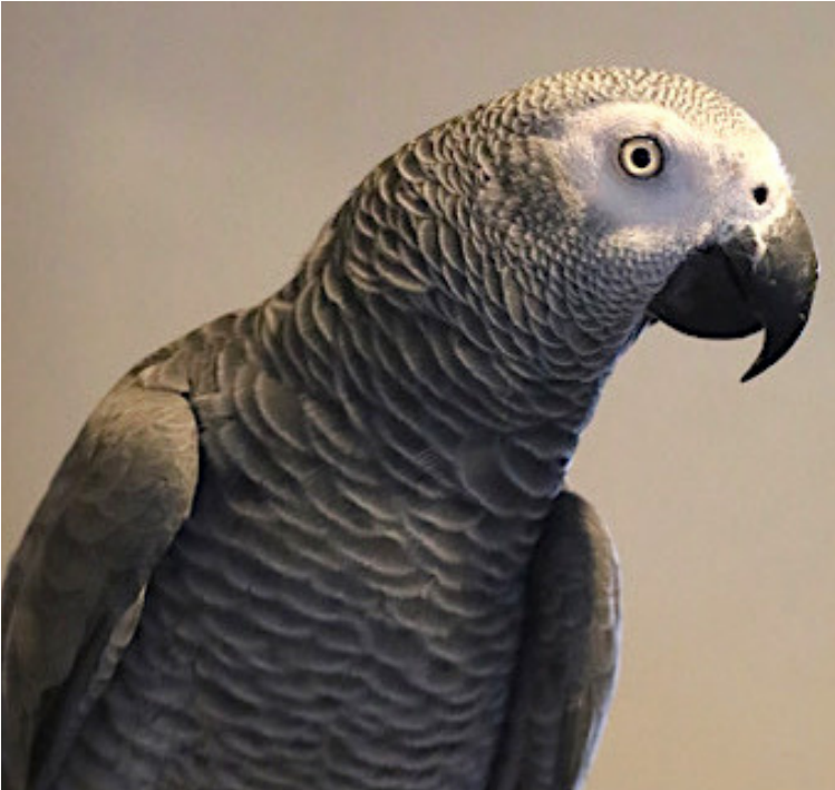
Congo African Grey. Classified as Endangered on the IUCN Red List. A CITES Appendix I trade restricted species.